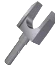
ASSISTED RESCUE TOOL ONLY If you already have a First-Man-Up™ Pole