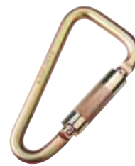
SAFLOK™ STEEL CARABINER Self Locking/Closing, 30 mm Gate Opening