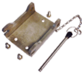
MOUNTING BRACKET for 9 m, 15 m, 25 m and 40 m Sealed-Blok™