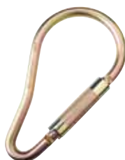
SAFLOK™ STEEL CARABINER Self Locking/Closing, 50 mm Gate Opening