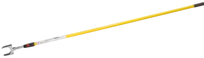
FIRST-MAN-UP™ POLE (2.4 - 4.8 m) with Assisted Rescue Tool