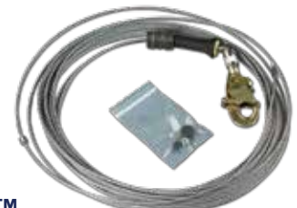
CABLE REPLACEMENT ASSEMBLY FOR FAST-LINE™