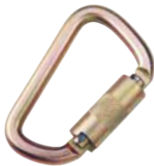
SAFLOK™ STEEL CARABINER Self Locking/Closing, 19 mm Gate Opening