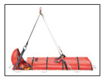
STEF tilting device allows the litter to be easily angled according to the terrain.