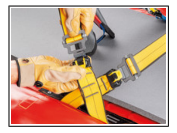
Adjustment is quick and easy, thanks to the FAST LT PLUS automatic buckles. The locking system of the buckle limits the risk of involuntarily unfastening.

The NEST litter was developed in partnership with the French national caving rescue organization. It allows a victim to be transported horizontally, vertically or at an angle. It is easy to manipulate and simplifies installation of a victim. It is suitable for all technical rope rescue, particularly in confined spaces.