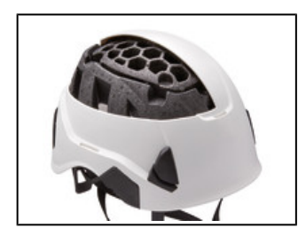
The liner is designed in two parts, EPP (expanded polypropylene) and EPS (expanded polystyrene) for reduced weight.

The STRATO VENT helmet is very lightweight and comfortable, thanks to its CENTERFIT and FLIP&FIT systems, which guarantee that the helmet fits securely on the head. The adjustable-strength chinstrap makes it ideal for both work at height and on the ground. It has ventilation holes that allow airflow through the helmet. With its potential for integration of a Petzl headlamp, hearing protection, and multiple accessories, it is an entirely modular helmet, thus responding to the specific additional needs of professionals.