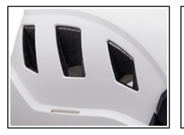
Ventilation holes allow airflow through the helmet.