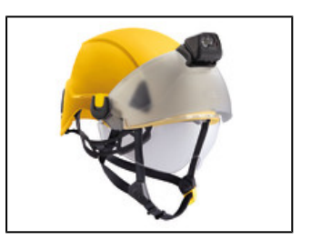
With its potential for integration of a Petzl headlamp, hearing protection, and multiple accessories, it is an entirely modular helmet, thus meeting the specific additional needs of professionals.