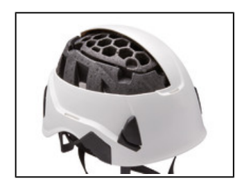
The liner is designed in two parts: EPP (expanded polypropylene) and EPS (expanded polystyrene) for reduced weight.

The STRATO helmet is very lightweight and comfortable, thanks to its CENTERFIT and FLIP&FIT systems, which guarantee that the helmet fits securely on the head. The adjustable-strength chinstrap makes it ideal for both work at height and on the ground. The unventilated outer shell protects against electrical hazards, molten metal splash and flames. With its potential for integration of a Petzl headlamp, hearing protection, and multiple accessories, it is an entirely modular helmet, thus meeting the specific additional needs of professionals.