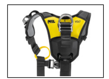
The harness has dorsal wear protectors, to reduce wear on the straps when moving about inside a wind turbine tower.

The VOLT WIND fall-arrest and work positioning harness is very easy to don, thanks to the FAST LT PLUS automatic buckles that allow the harness to be donned with feet on the ground. Wide, semi-rigid waistbelt and leg loops give excellent support. Its lightweight, breathable construction maximizes air flow. It features a textile dorsal attachment point designed for connecting a self-retracting fall-arrest system. It has wear protectors on the waistbelt and dorsal point to limit wear when moving about inside the wind turbine tower. It is certified to U.S. and European standards.